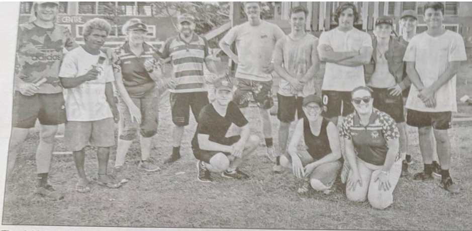
The visiting students and staff with a local.