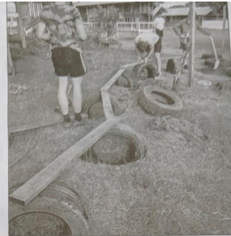
Work on improving the playing facilities.